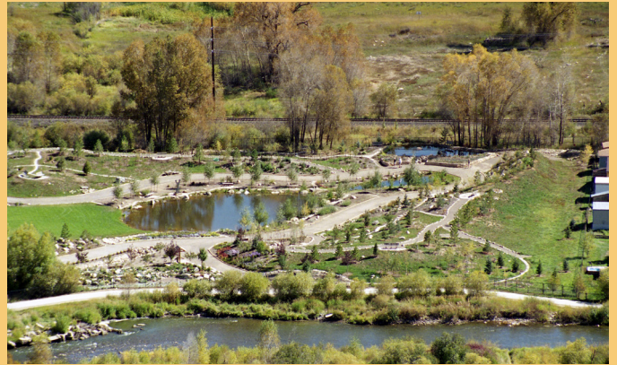
1997 Aerial Photo

Now, more than a quarter of a century later, it is imperative that we update the Botanic Park's aging irrigation system, especially in light of the importance of water conservation. During the Passport Through the Botanic Park's live auction and paddle raise, I posed a question to the audience: Who among you would raise your paddle to support the overhaul of the Park's irrigation system? It was a bold move, as we didn't possess a concrete plan or a budget at the time. However, we recognized the dire need for the community's support