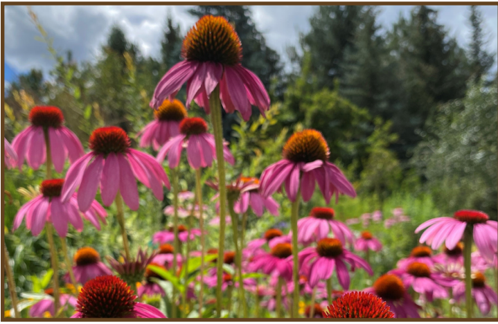
Echinacea purpurea, commonly known as coneflower, is a good water wise perennial.