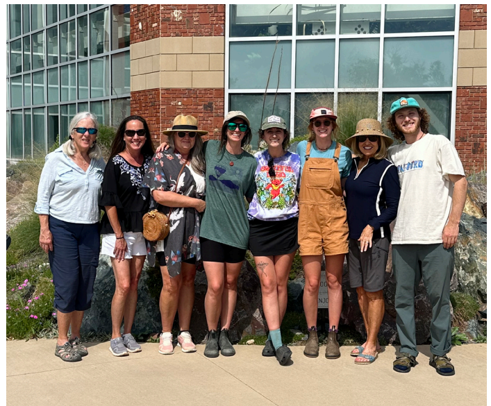
YRBP staff visited the Cheyenne Botanical Gardens this season and had a great time visiting with their staff and learning about their gardens and conservatory. It's a must stop if you are in the area.

The evening continued with a delicious meal and everyone celebrating those who make the Botanic Park bloom – it's members, volunteers, and staff. Thank you for a great year!